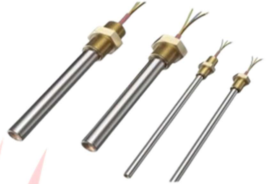
HIGH DENSITY CART.HEATER