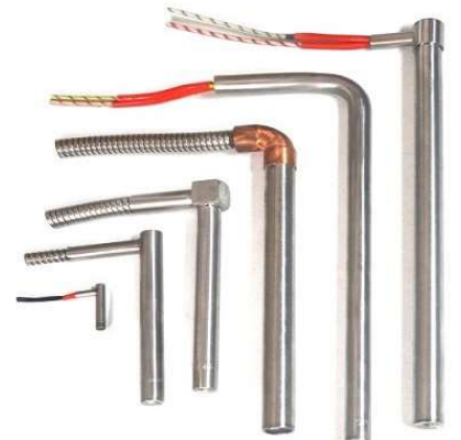
LOW DENSITY CART.HEATER