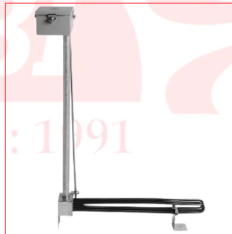
OVER THE SIDE IMMERSION