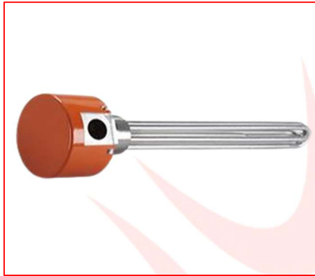
SCREW PLUG IMMERSION

We manufacture following types of heaters.