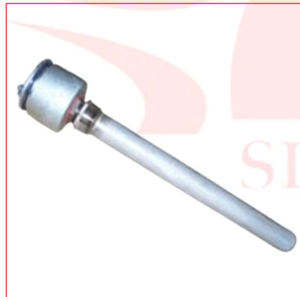
PIPE PLUG IMMERSION